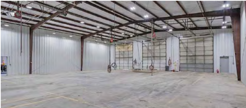
3 Service Bays