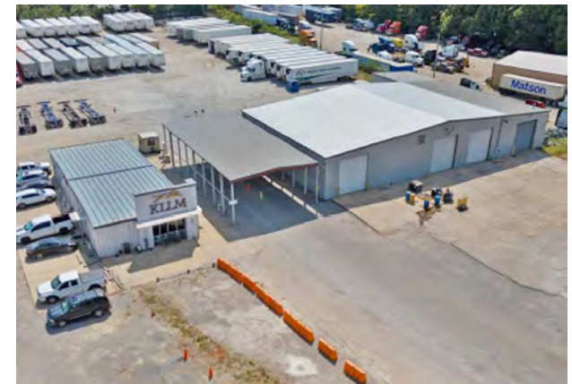
Parcel A's Buildings