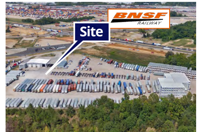
Parcel A's Proximity to BNSF