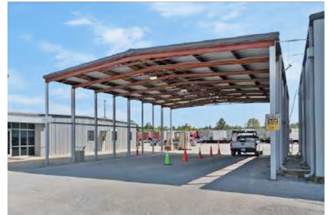
Exterior Canopy (Covered Area)