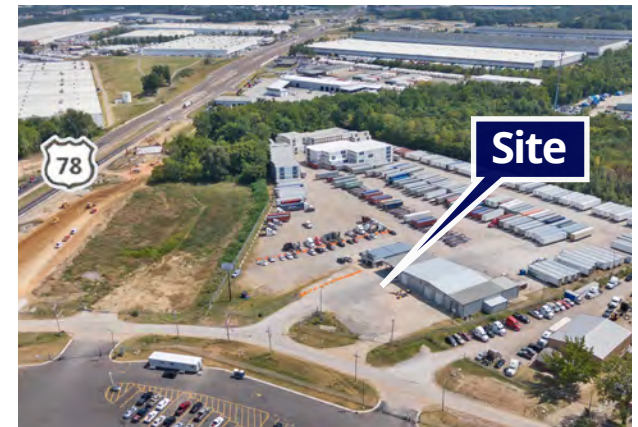
Parcel A's Proximity to Hwy. 78