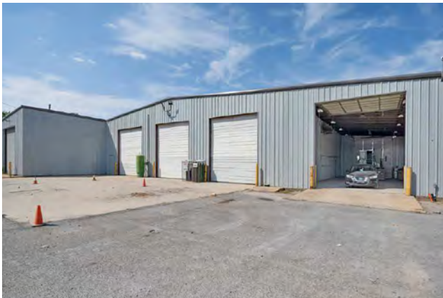
Back of Bays